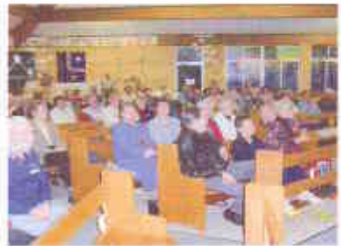
Some of the congregation enjoying the music.